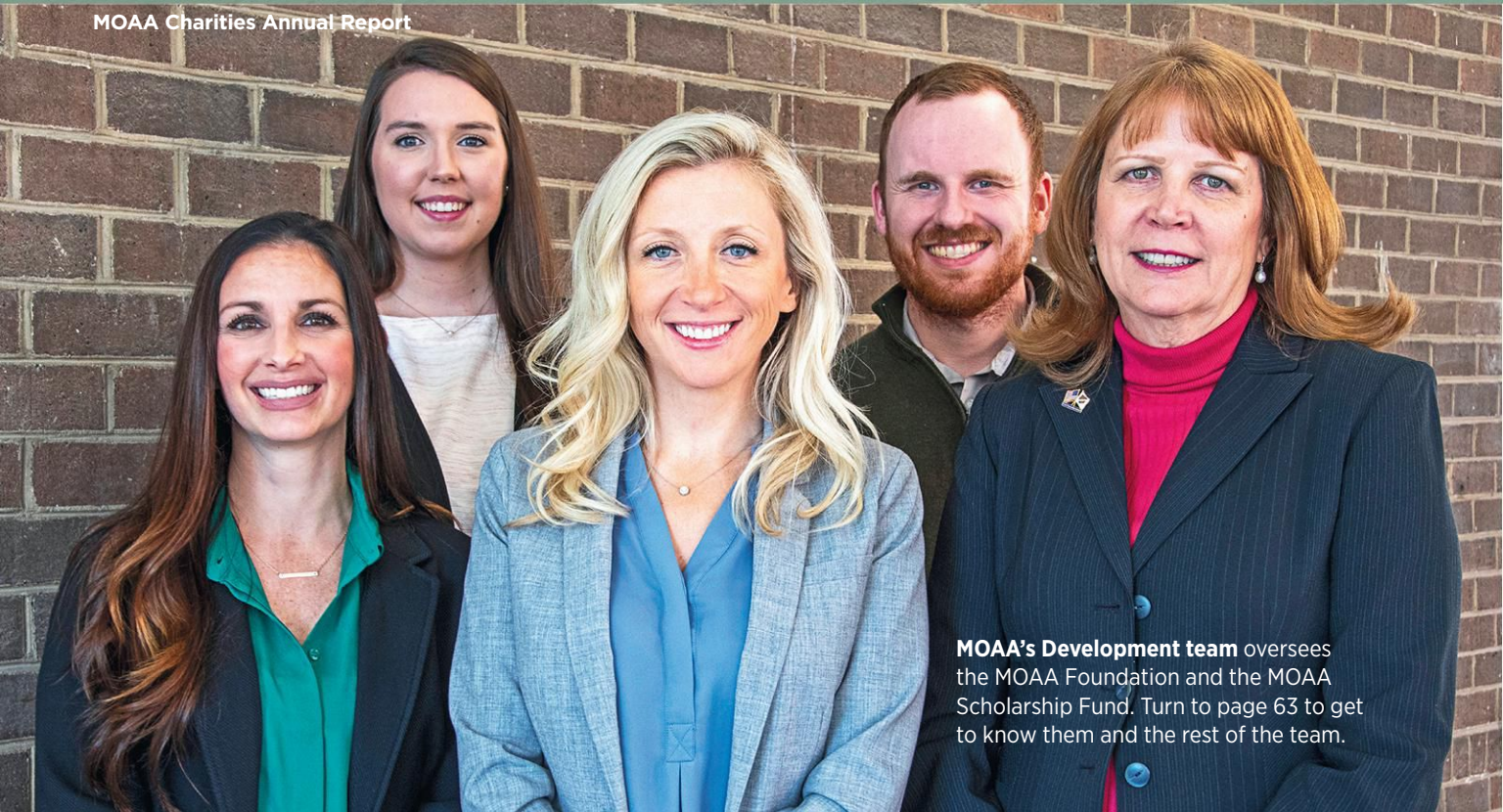
MOAA's Development team oversees the MOAA Foundation and the MOAA Scholarship Fund. Turn to page 63 to get to know them and the rest of the team.